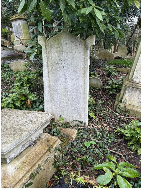
First Grave. June 1860