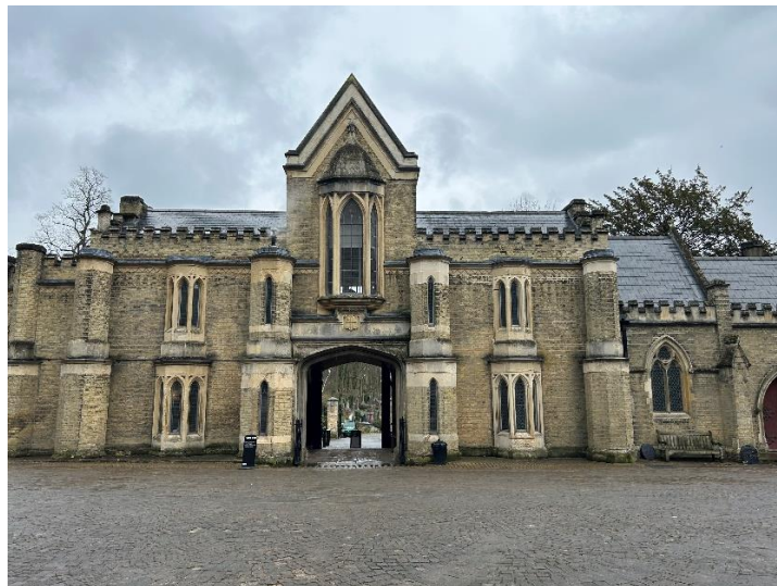
Entrance. Chapel & Courtyard

In total there are currently 53,000 graves and 170,000 bodies interred; some very grand and some unmarked pauper mass graves.