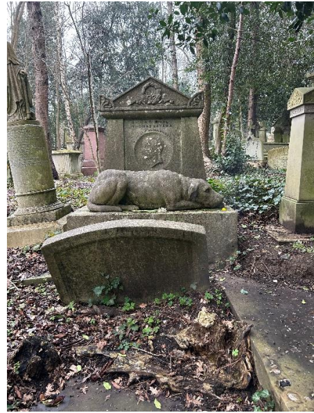
Most famous 1865 – Thomas Sayers