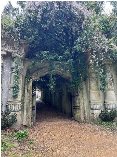
Egyptian entrance to catacombs

Even here the class distinctions so important at the time were evident with the more opulent memorials at the top of the hill and the social status of the occupants reducing as you go down .