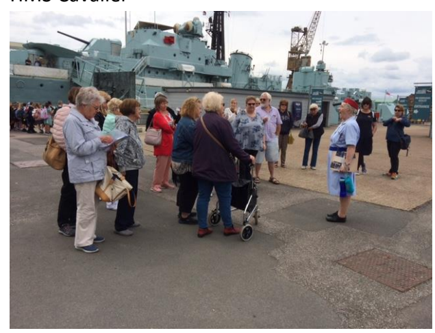
Call the Midwife tour