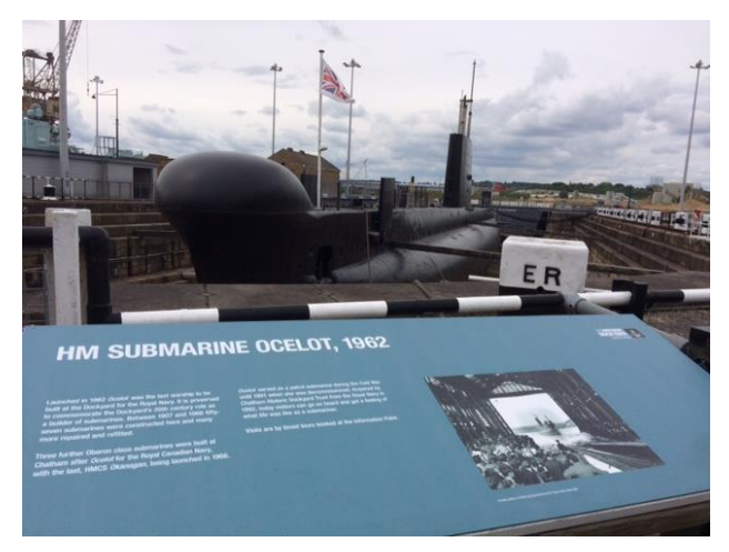
HM Submarine Ocelot

The site is enormous with plenty of vessels to explore and exhibitions to visit, towards the end of our visit we were able to see a fly past of Dakotas on their way to France for the 75<sup>th</sup> anniversary of D-Day.